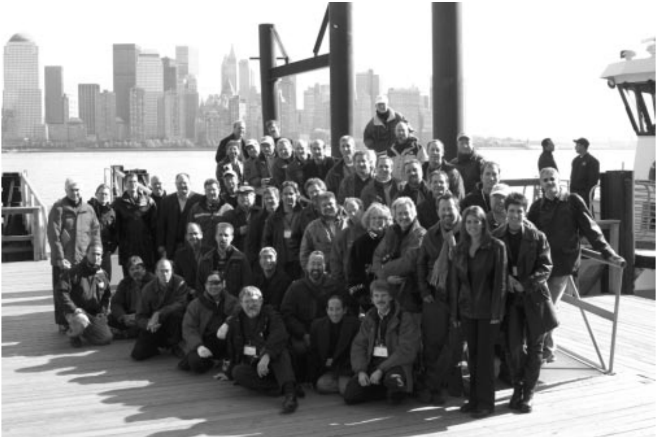
ASMP leaders, members and staff, photographed against the backdrop of the Manhattan skyline.

2002 BLC and Members Convention